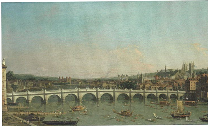
Westminster Bridge from the north with the Lord Mayor's Procession , by Canaletto (1697-1768). 1750.