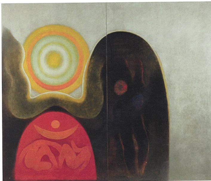
Untitled , by Ghulam Rasool Santosh (1929-97). 1969.