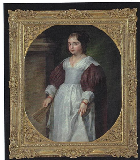
Portrait of a young girl in a white by Anthony Van Dyck (1599-1641). c.1630. Oil on canvas, 99 by 83 cm.